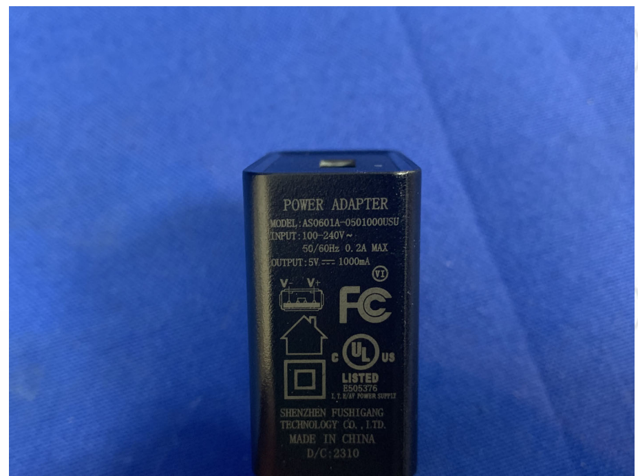
View of Product-19

Report No. : EED32P80738601 Page 43 of 44