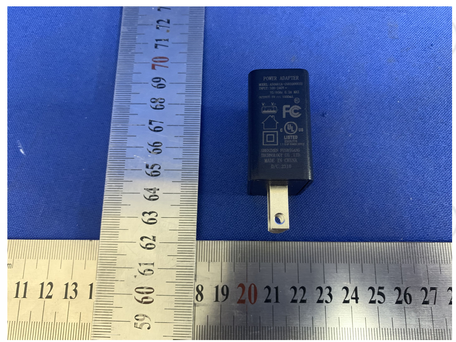
View of Product-17

Report No. : EED32P80738601 Page 42 of 44