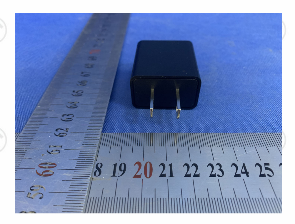
View of Product-18