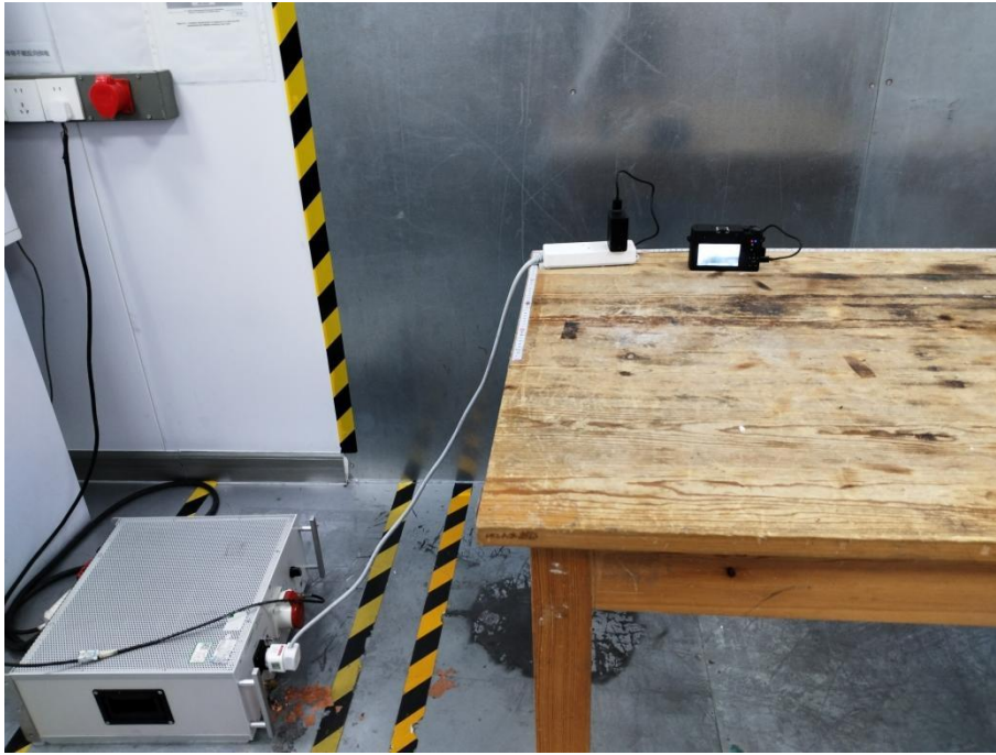
Emissions in frequency bands (below 1GHz)