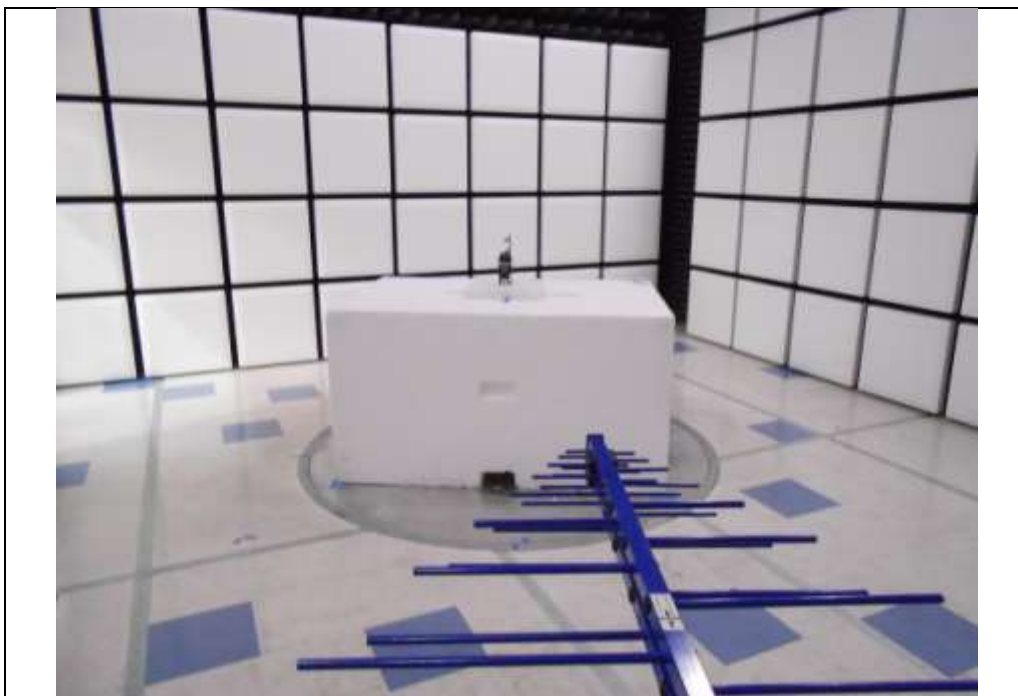
RF Radiated #2