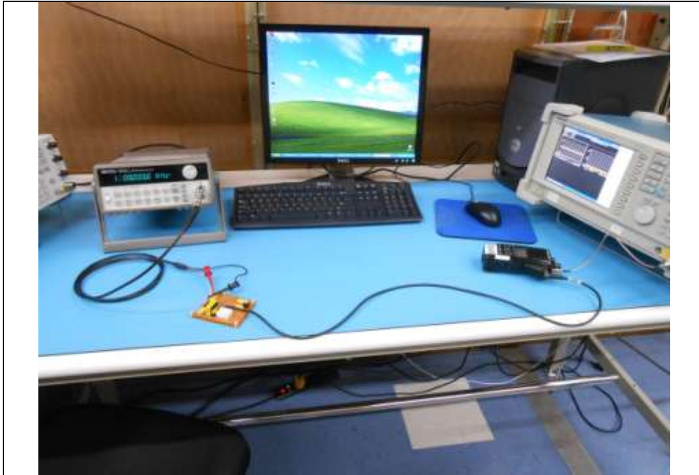
RF Conducted #2