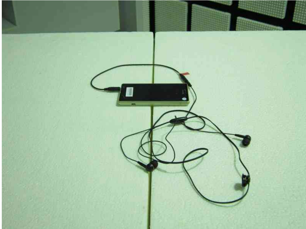
– X-axis –