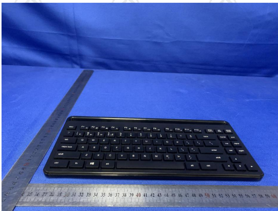
View of Product-2