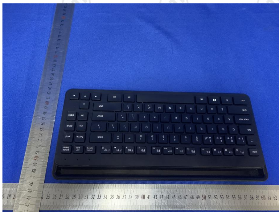
View of Product-4