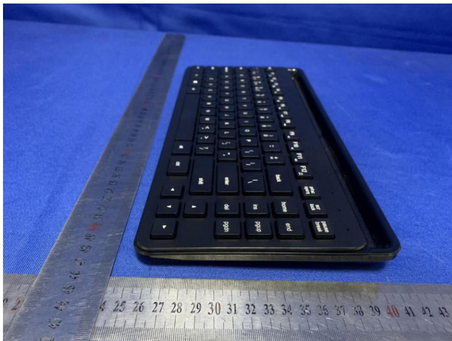
View of Product-3