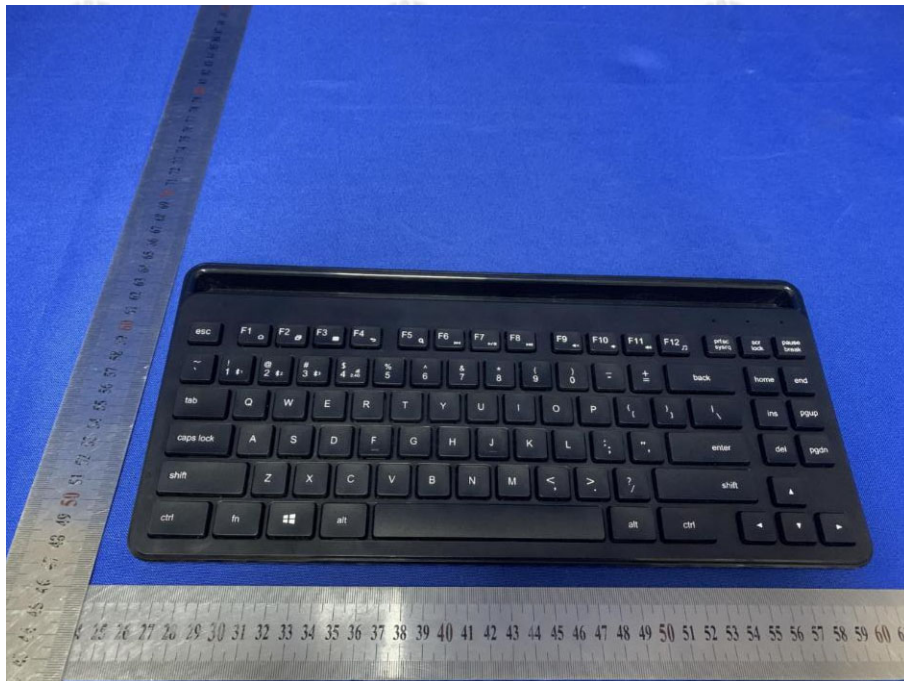
View of Product-1