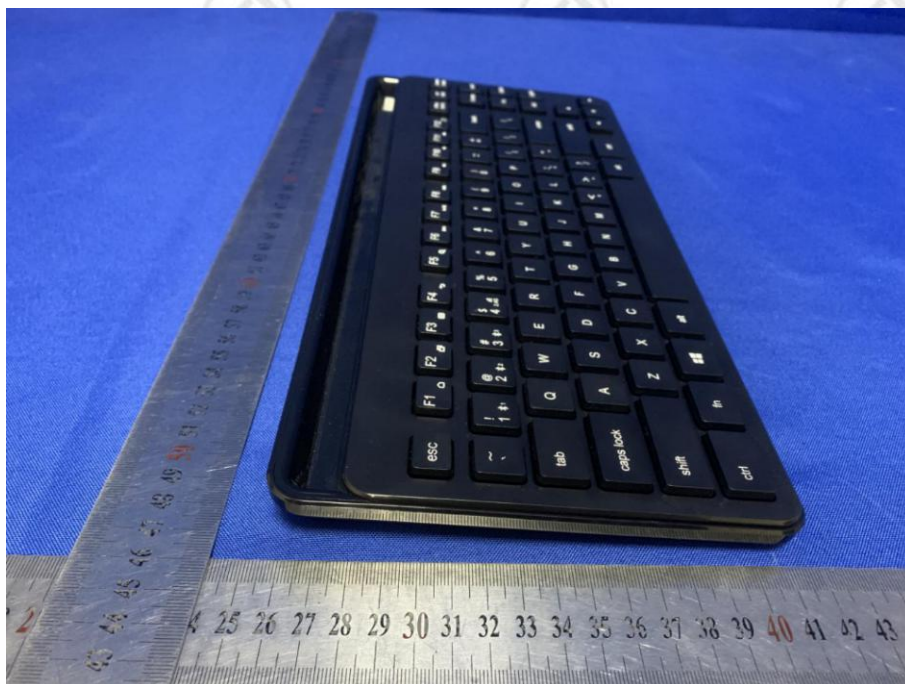
View of Product-5