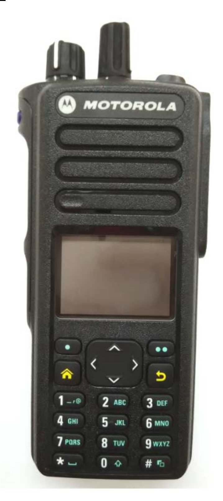
Exhibit 3A – Front View

Front view with display and full keypad model