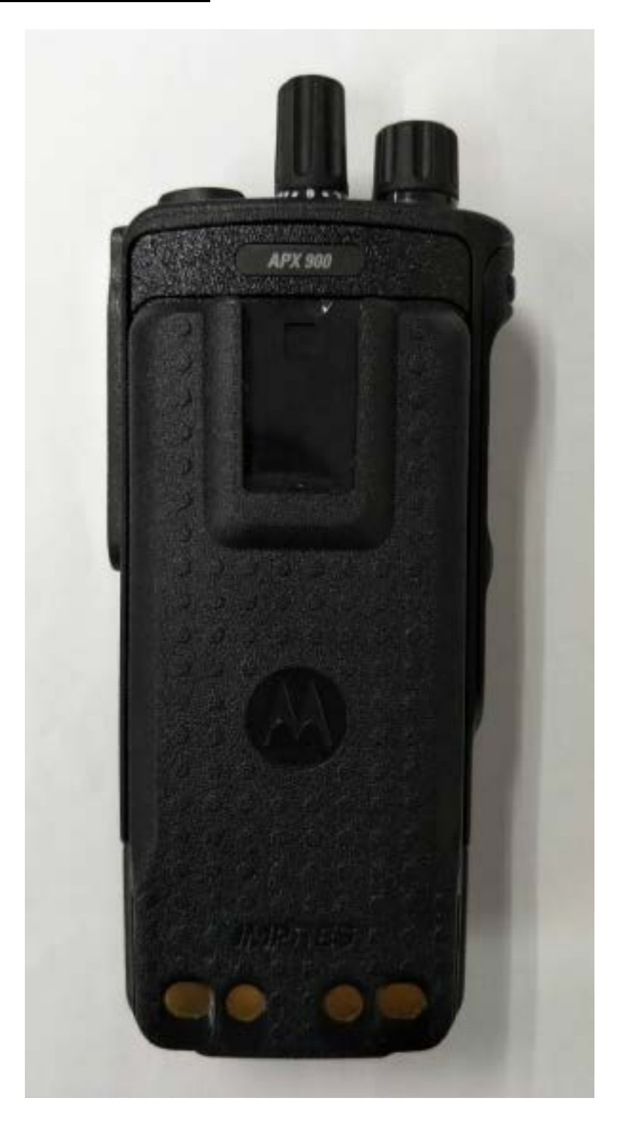
Exhibit 3B – Back View with Battery