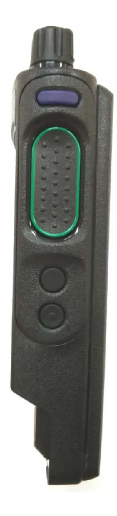
EXHIBIT 3 SHEET 7 OF 10