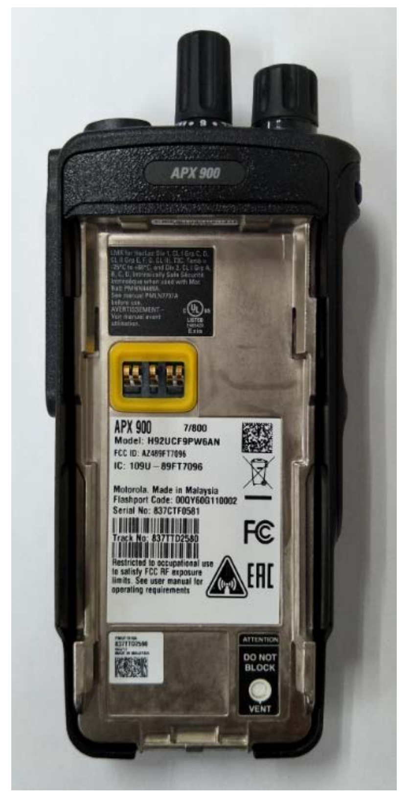
Back View (FCC label for Limited Keypad Version)