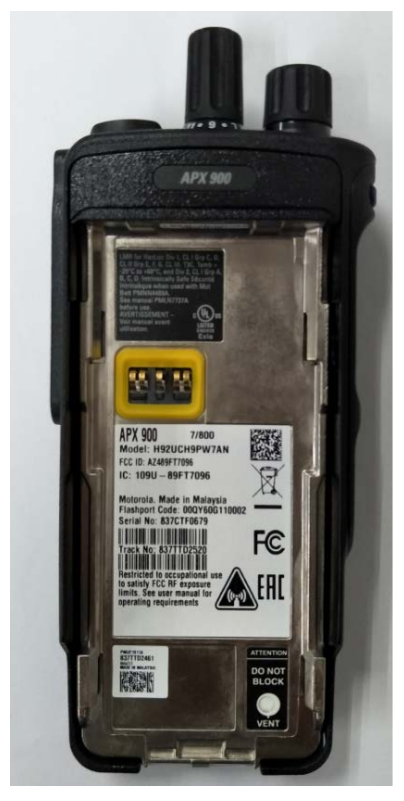
Exhibit 3C – FCC/IC Labels Location

Back View (FCC label for Full Keypad Version)