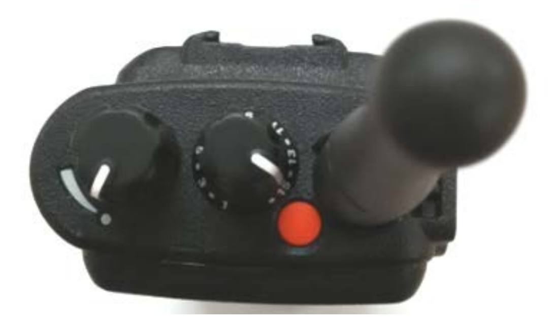
Exhibit 3F – Top View