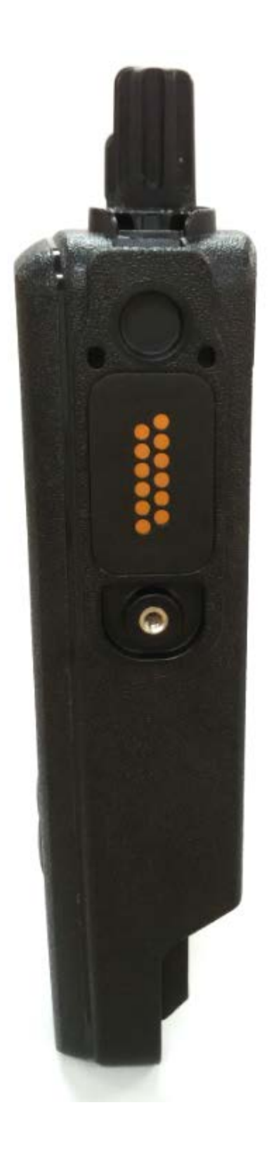
EXHIBIT 3 SHEET 8 OF 10