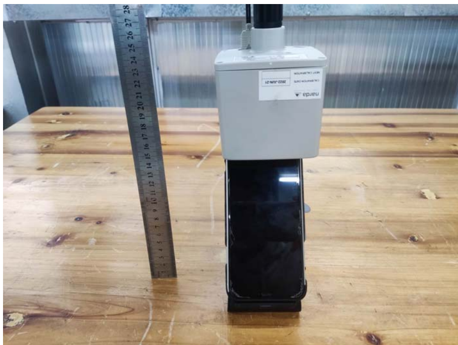
Test Position F-20cm from the edge of EUT to the geometric center of the probe