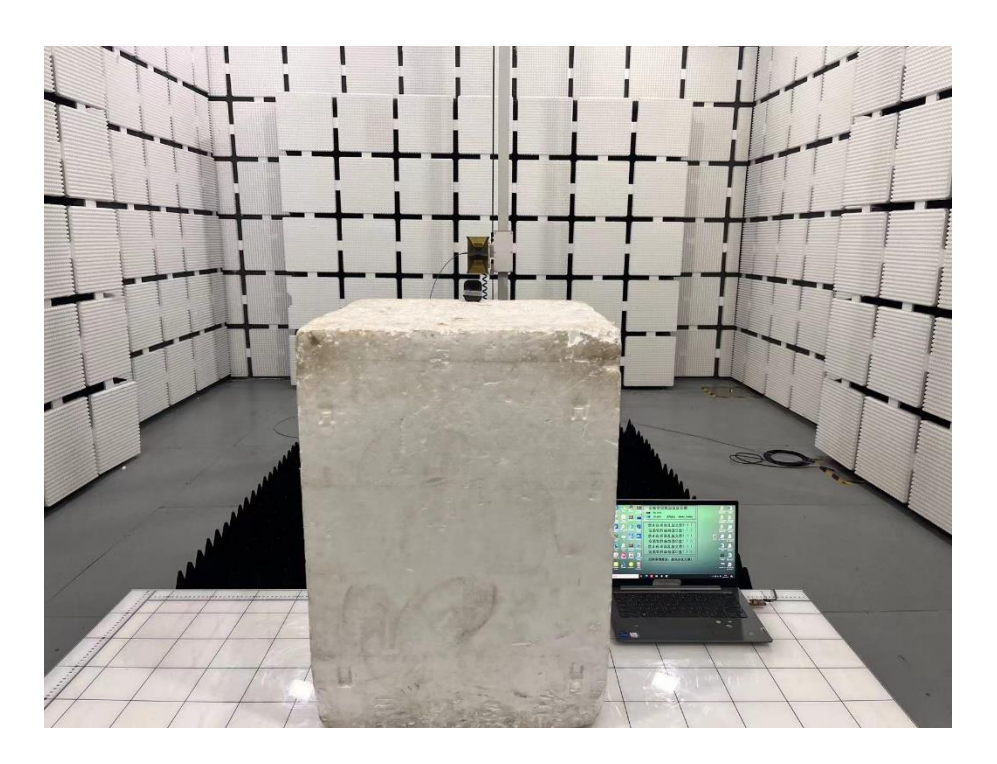
Set-up for Radiated Spurious Emission, Above 1GHz

Set-up for Radiated Spurious Emission, Below 1GHz