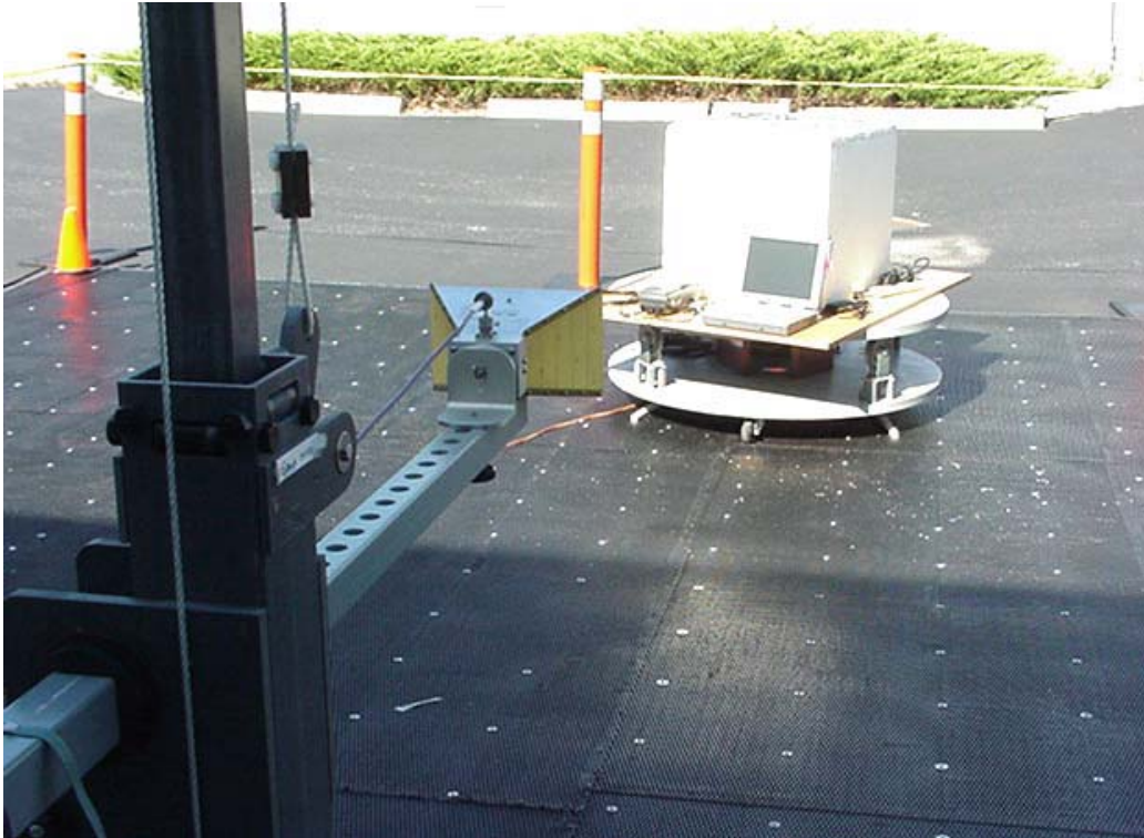
With Horn Receive Antenna