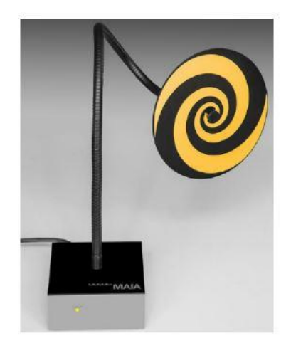
Modulation and Interference Analyzer (MAIA)

MAIA is a hardware interface for evaluating the modulation and audio interference characteristics of RF signals in the frequency range 698–6000 MHz, the DASY6 evaluates the time-domain and frequency-domain properties of the uplink signal transmitted by the DUT during SAR measurement with MAIA. It uses USB-powered active electronics to identify the modulation of the DUT. It can be operated with the over-the-air interface using the built-in ultra-broadband planar log spiral antenna (698–6000 MHz) or in the conducted mode using the coaxial SMA 50W connector (300–6000 MHz).