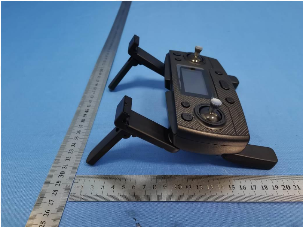
PORT VIEW OF EUT-1