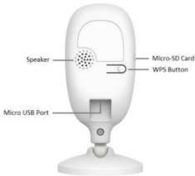
Figure 2: Back Panel