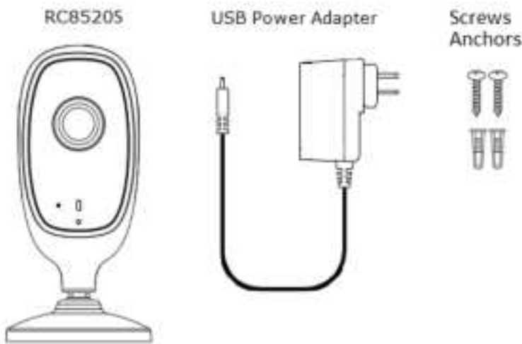
Figure 3: Package Contents

The following items should be included in the package: If any of these items are damaged or missing, please contact your dealer immediately.