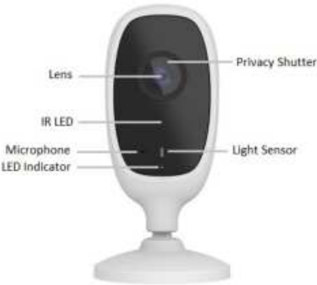
Figure 1: Front Panel