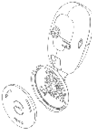
Figure 5: Mounting Plate