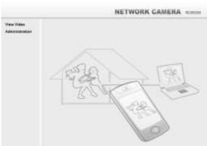
Figure 7: Home Screen