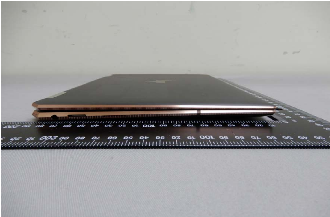
Side View of EUT – 3