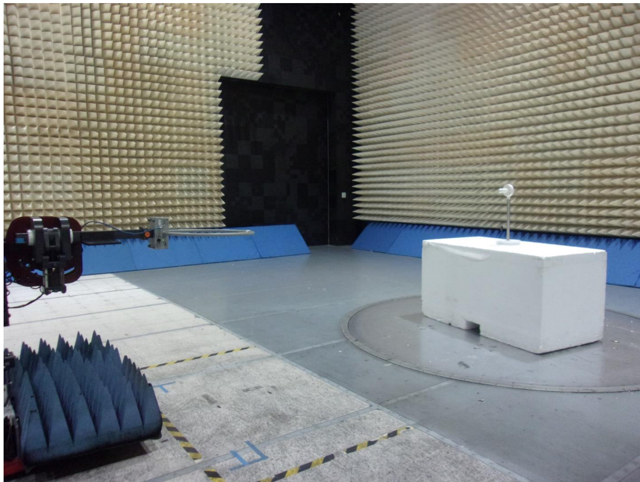
Radiated spurious emissions, 9 kHz – 30 MHz