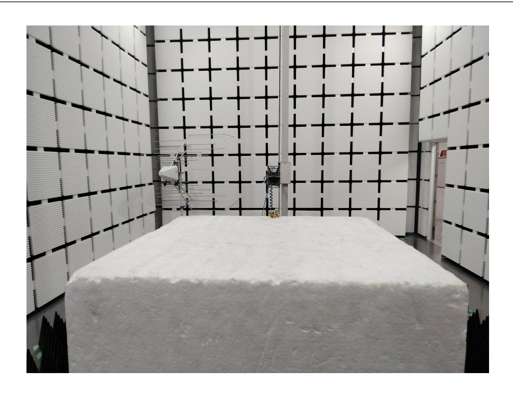
Radiated Spurious Emission (below 1GHz)