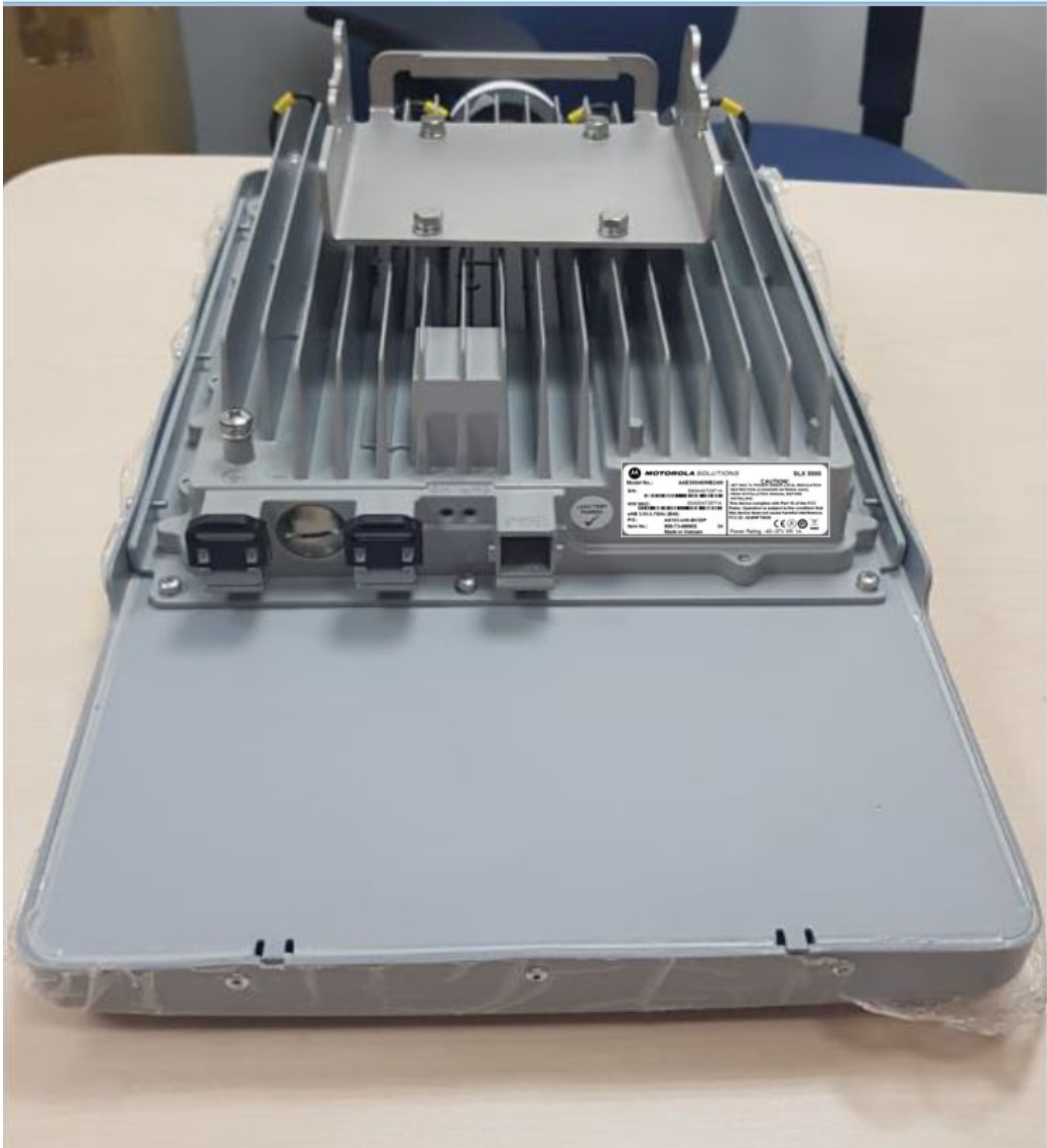
Bottom View with Label Placement Location