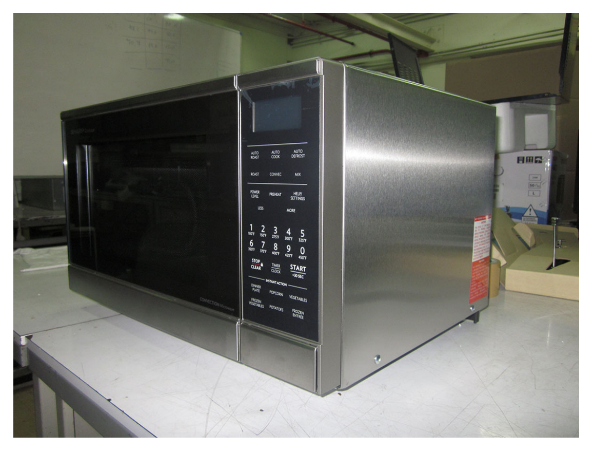
Fig. 1: Front view of appliance