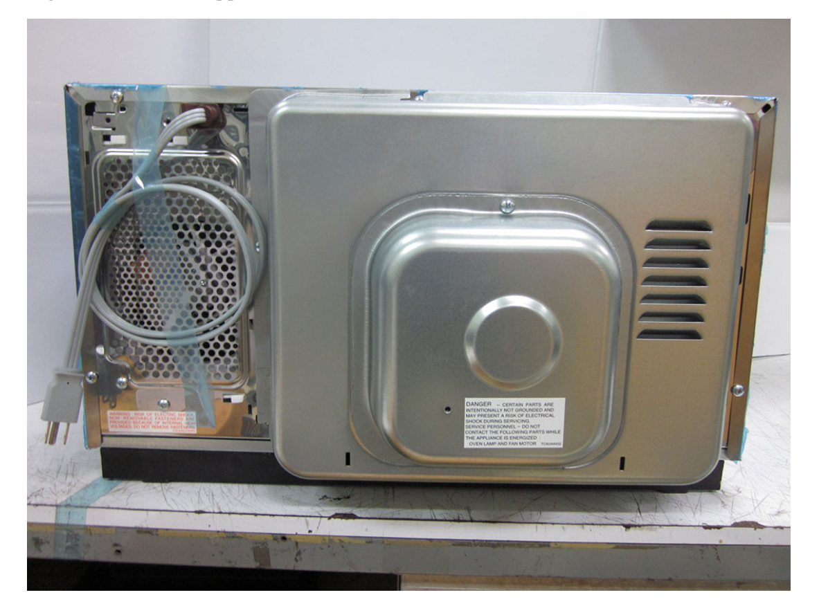
Fig. 2: Rear view of appliance