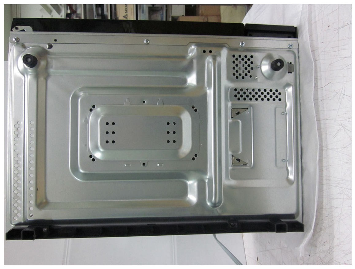
Fig. 3: Bottom view of appliance.

Fig. 4: Inside oven cavity with door open.