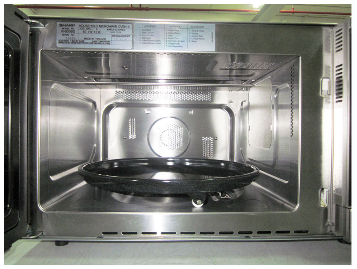
Fig. 4: Inside oven cavity with door open.