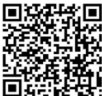
For Andriod Device