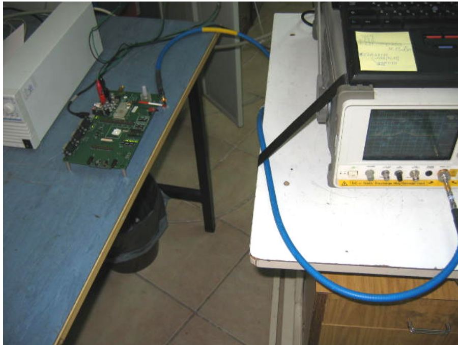
Photograph No.1 Peak output power, occupied bandwidth, conducted spurious emissions test setup