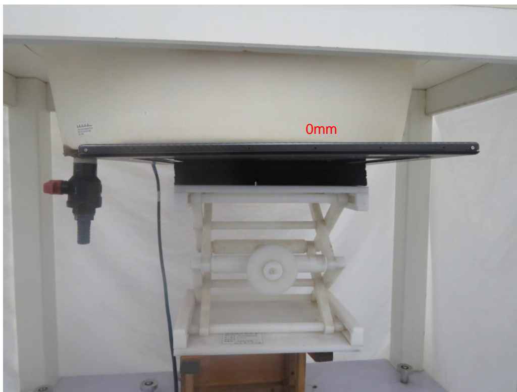
Picture 3: Front Side Scan 3, the distance from EUT to the bottom of the Phantom is 0mm