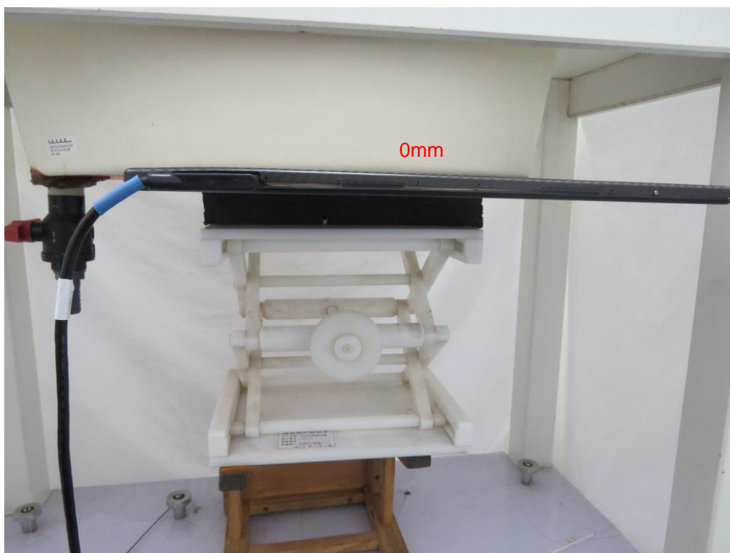
Picture 4: Front Side Scan 4, the distance from EUT to the bottom of the Phantom is 0mm