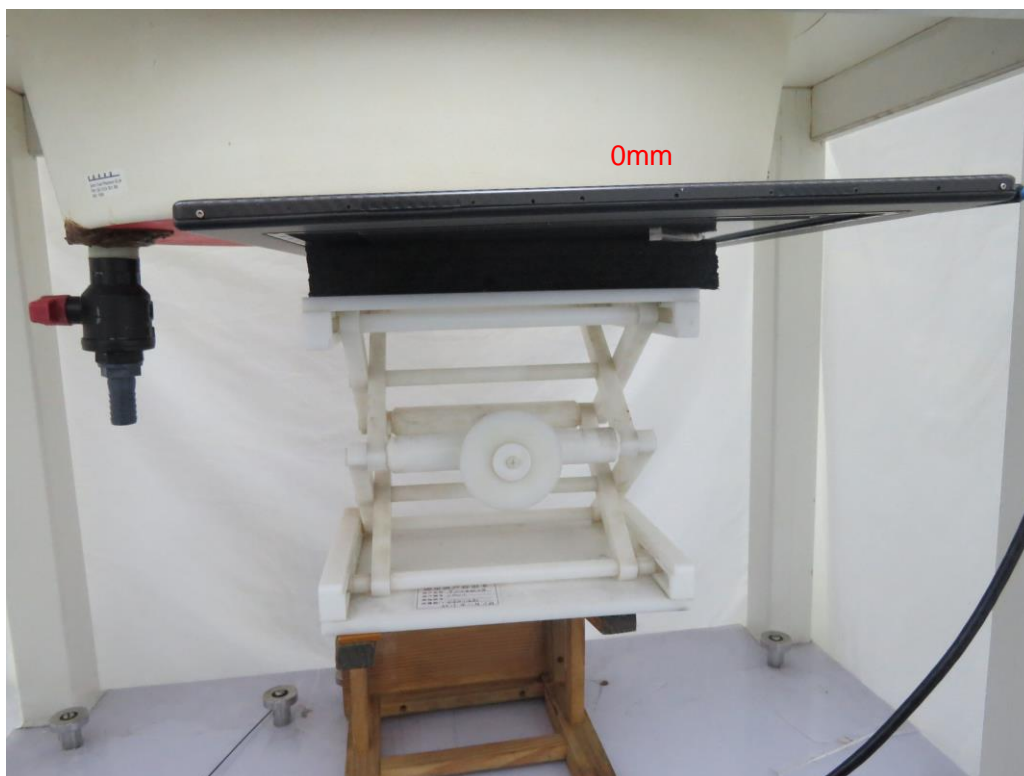
Picture 1: Front Side Scan 1, the distance from EUT to the bottom of the Phantom is 0mm