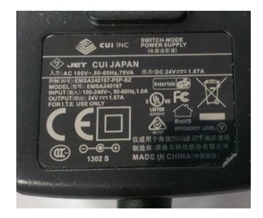
Figure 12 – Base view/ Rating label position