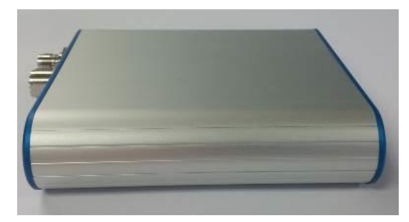
Figure 8 – Rotated view