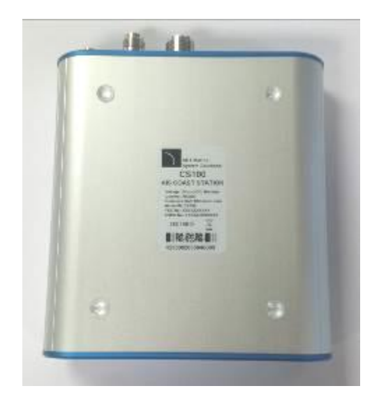
Figure 11 – Base view/ Rating label position