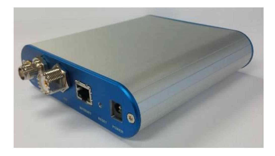
Figure 9 – Rotated view