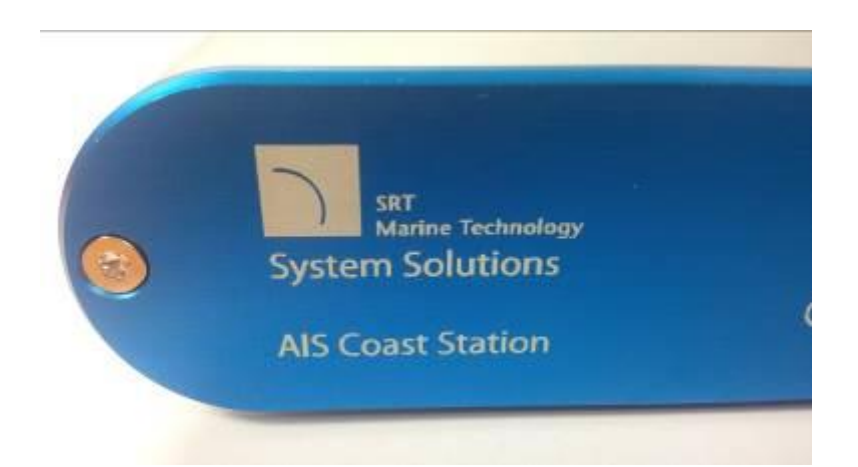
Figure 6 – Rotated view