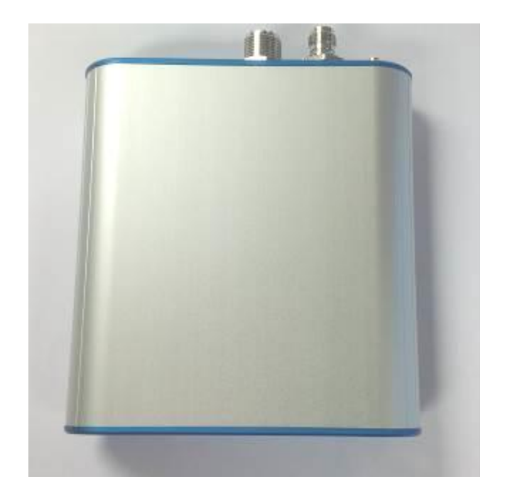
Figure 10 – Top view