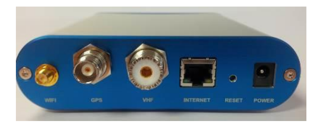
Figure 4 – Connector/LED View