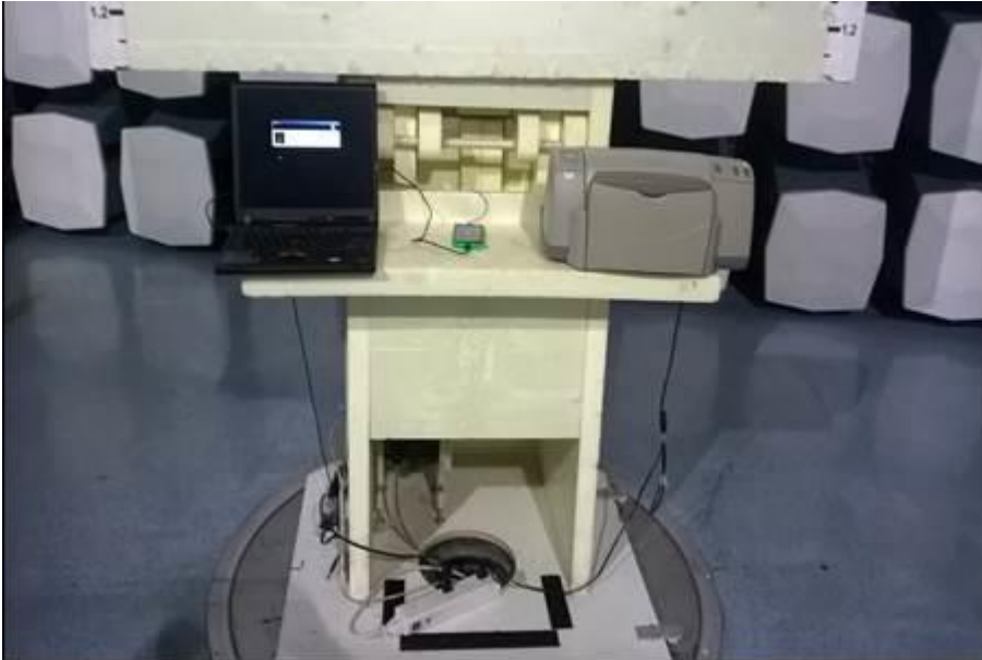
Picture 3. FCC Part 15B Radiated emissions, computer peripherals