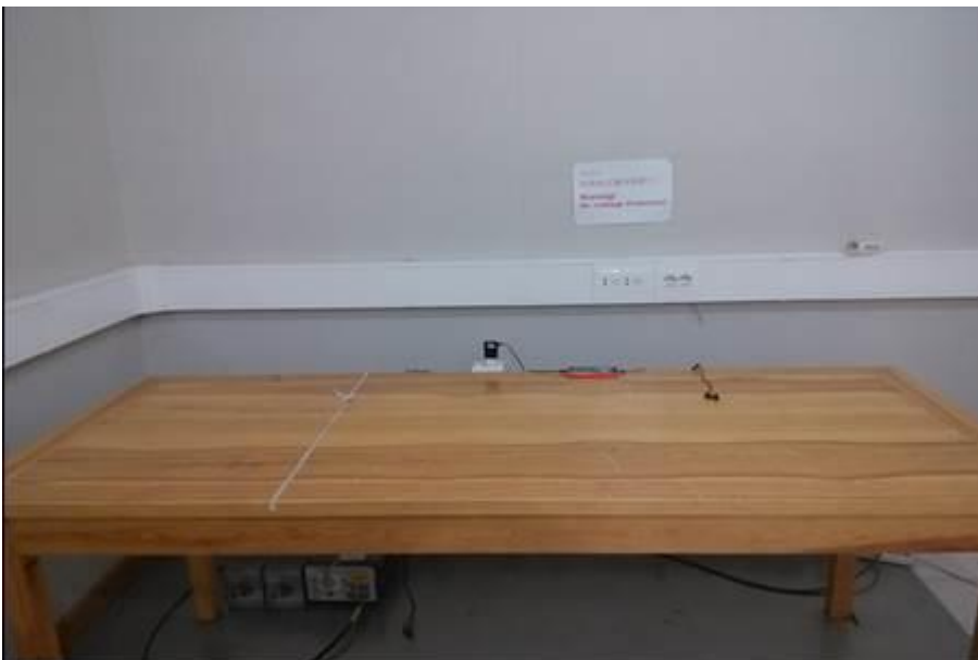
Picture 4. FCC Part 15C AC powerline conducted emissions