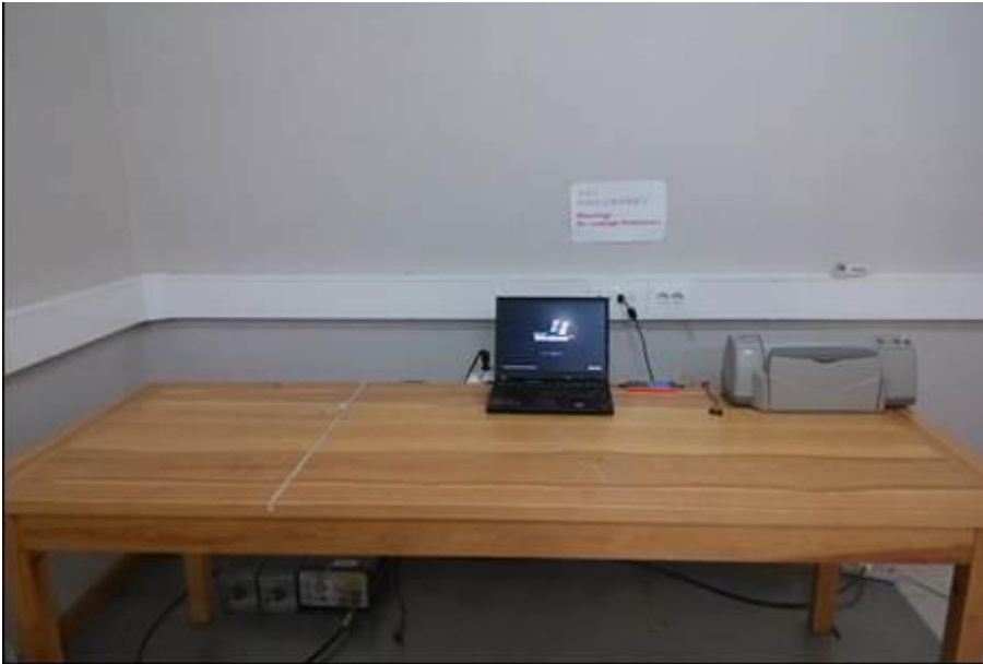
Picture 5. FCC Part 15B AC powerline conducted emissions, computer peripherals, measure from PC charger