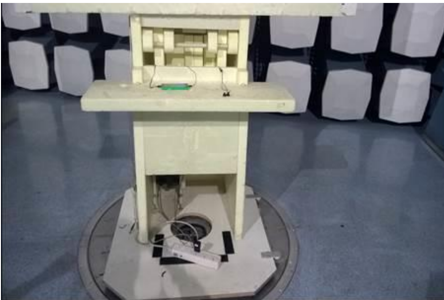
Picture 2. FCC Part 15B Radiated emissions