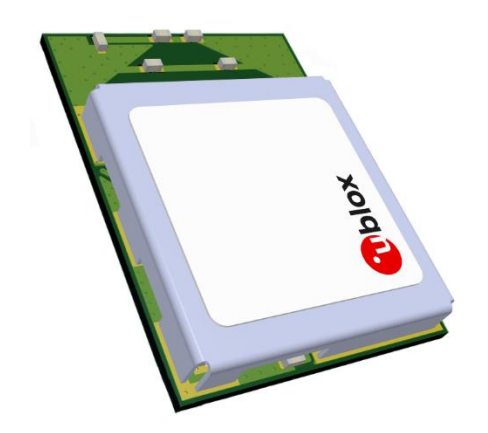
Figure 3: Label location of the NORA-W10 modules

The modules are SMT components shipped to the OEM-integrator on Tape&Reel packed in a sealed Dry-Pac bag and mounted onto the host board by automatic "Pick&Place" machines. As the module is a surface mount device that is soldered onto the host it is not possible to place the label on the secondary side of the module.