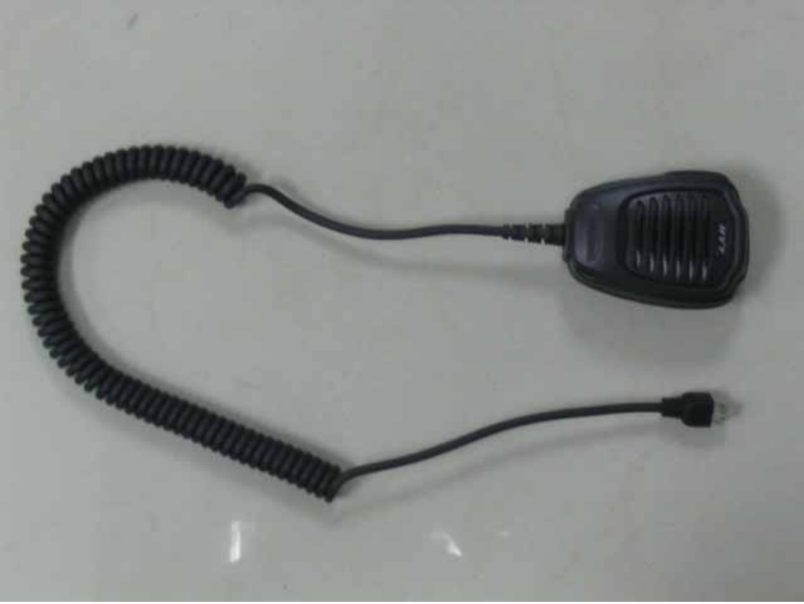
Bottom view of Microphone