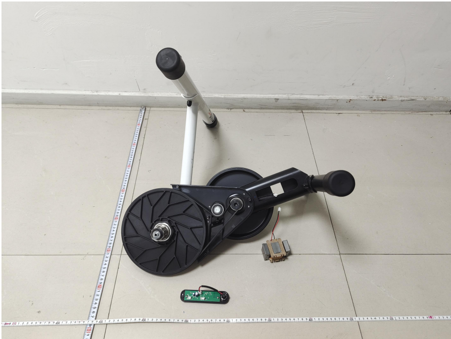
INTERNAL PHOTO OF SAMPLE