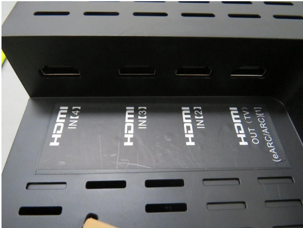
View of EUT-4