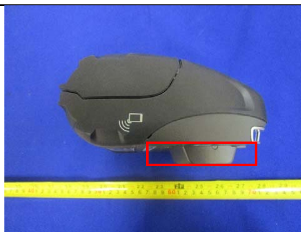
Extended battery installed

The extended battery has larger capacity. The printer is to be used with the bottom side against human body, the use of extended battery will increase the separation of printer bottom side to human body, thus decreasing the SAR value. The SAR testing in current report was performed with regular battery to represent the worst case.