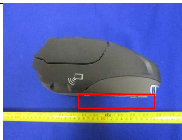
Regular battery installed