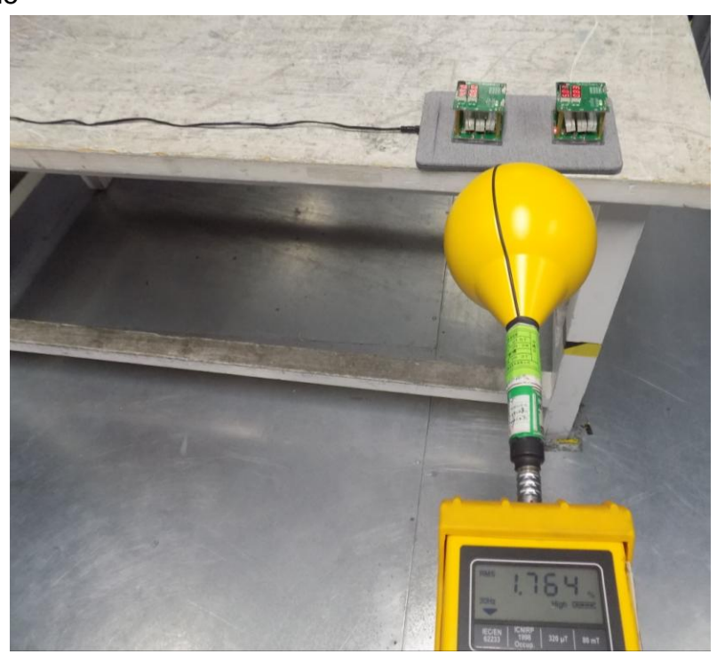
For No load mode