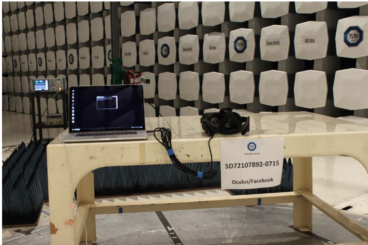
Radiated Emissions Test Setup (above 1GHz)