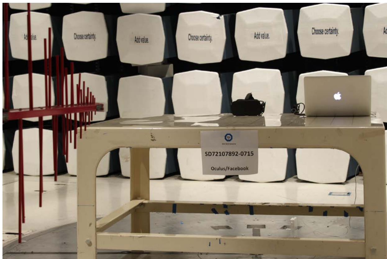
Radiated Emissions Test Setup (below 1GHz)