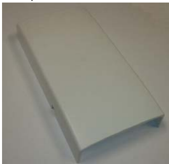
Figure 1: Top view