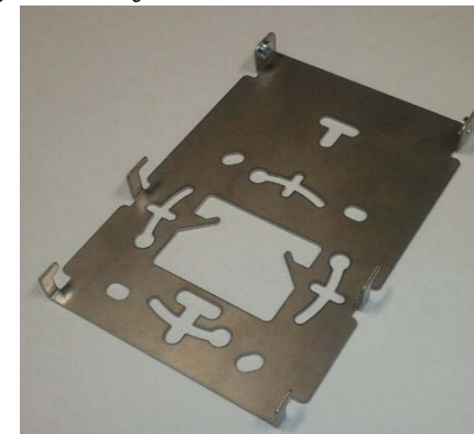
Figure 3: Mounting bracket