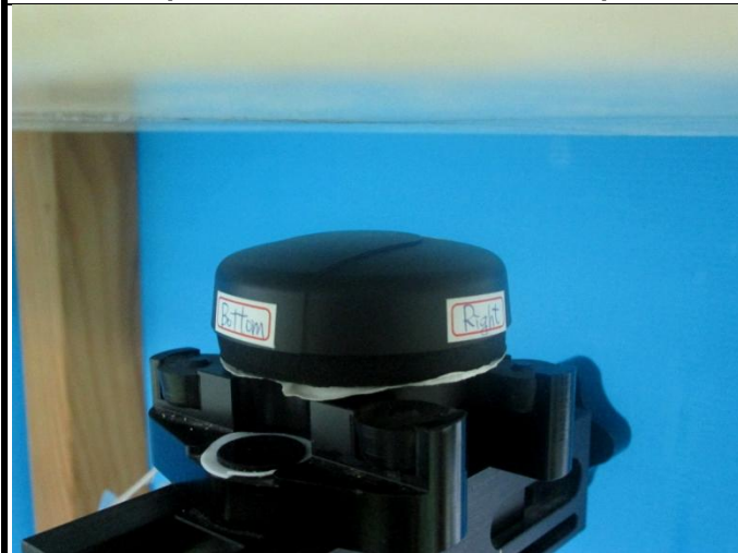
Front Face of Antenna with 2 cm Gap