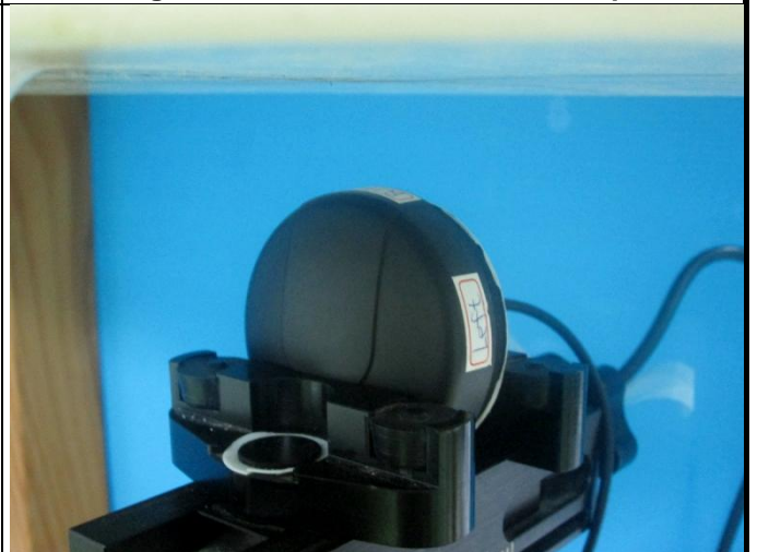
Bottom Side of Antenna with 2 cm Gap