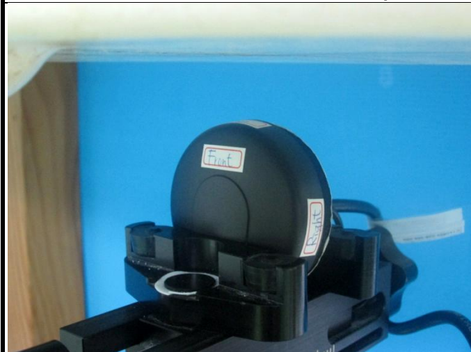
Top Side of Antenna with 2 cm Gap