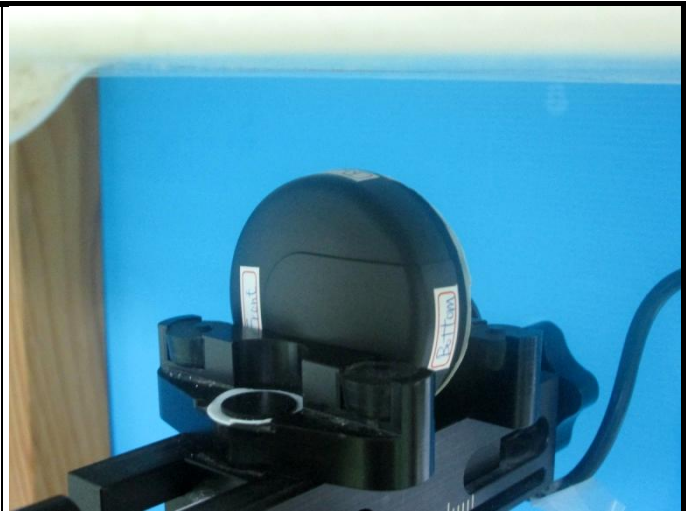
Right Side of Antenna with 2 cm Gap