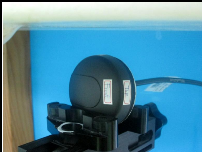
Left Side of Antenna with 2 cm Gap