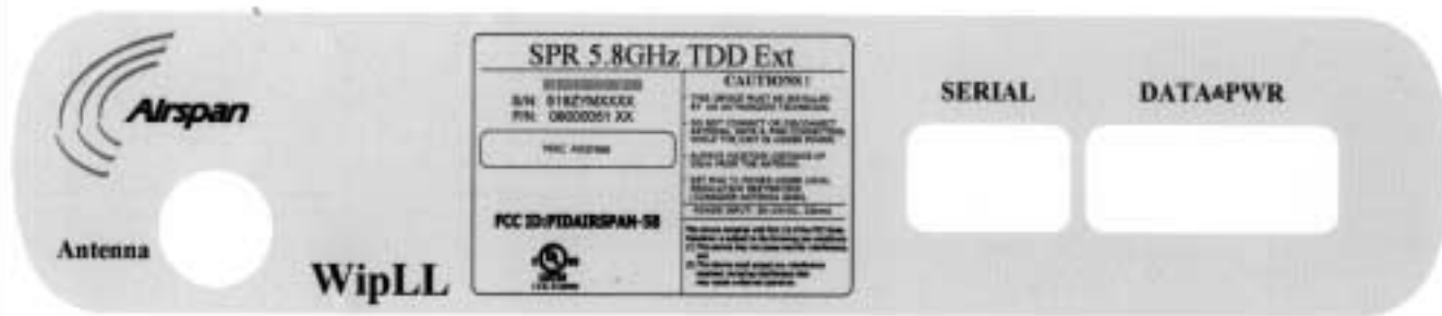
“SPR 5.8GHz TDD Ext” bottom, label with FCC ID:PIDAIRSPAN-58 location