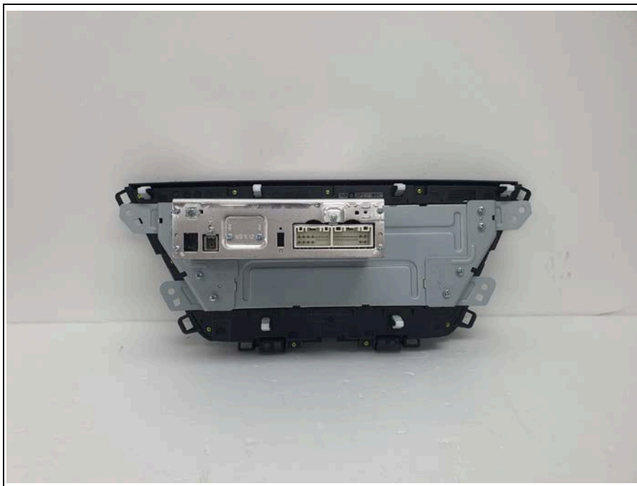
Model name: AU210TYGU