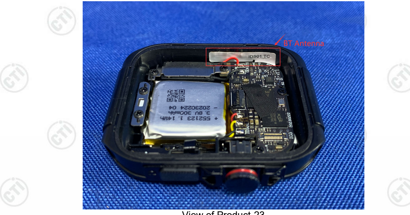
View of Product-23

The test report is effective only with both signature and specialized stamp, The result(s) shown in this report refer only to the sample(s) tested. Without written approval of CTI, this report can't be reproduced except in full.