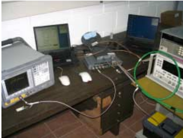
Photograph No.1 Peak output power, power spectral density, occupied bandwidth, spurious Measurements at RF antenna connector test setup