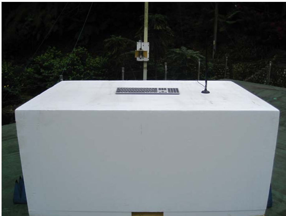
Above 1 GHz