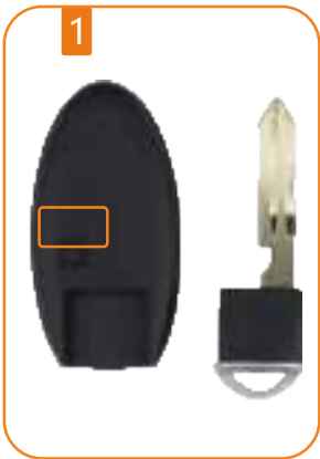
Press the back side button for loose the mechanical key holder

First use or when the battery runs out need to change new battery, following steps: