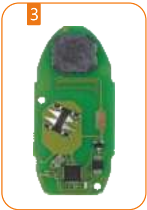
Take the battery out and replace new one

Note: The battery type is 2032 with 3V, ensure the positive and negative of battery is correct.