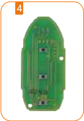
Install the key same as before

Note: The battery type is 2032 with 3V, ensure the positive and negative of battery is correct.