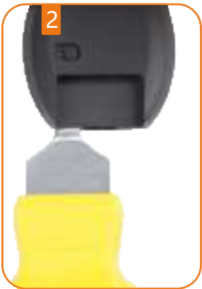
Use the tool into the gap to separate the shell