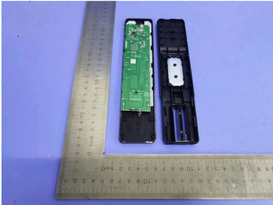
Photo 9 Appearance of PCB