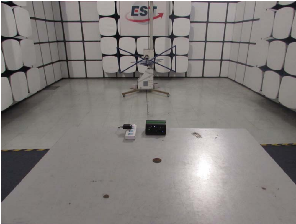
Radiated Test (1000-25000 MHz)