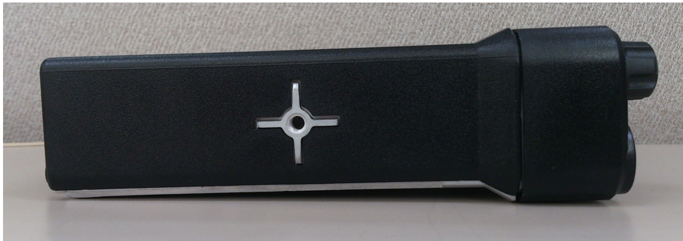
Side view (Left)