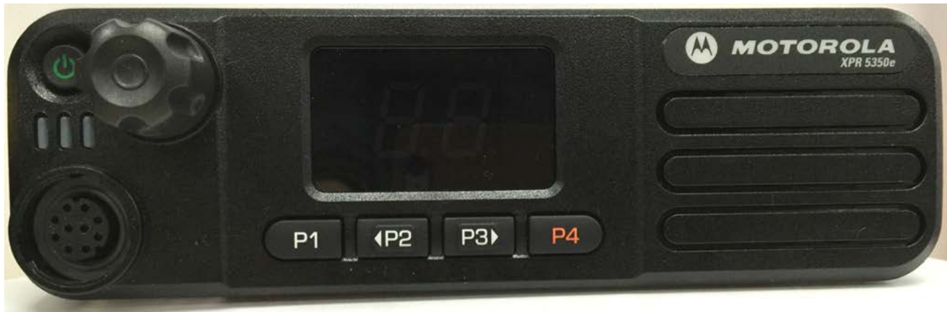
Front view (Numeric Display)