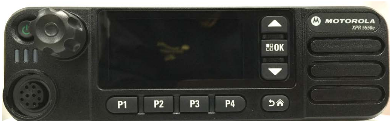
Front view (Color Display)