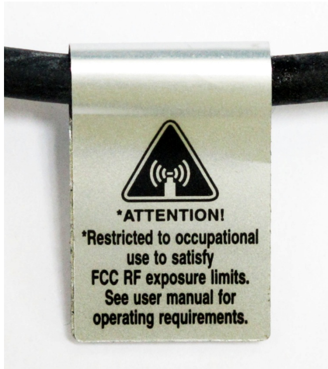
RF Exposure Label (Close View)