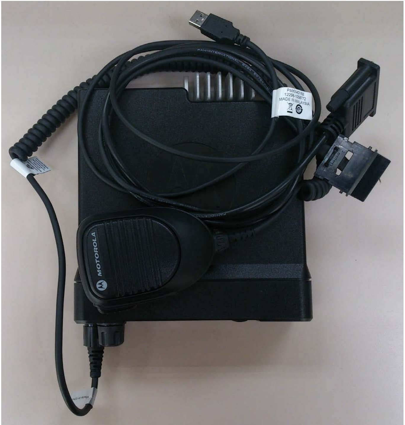
Top view with microphone and rear accessory cable