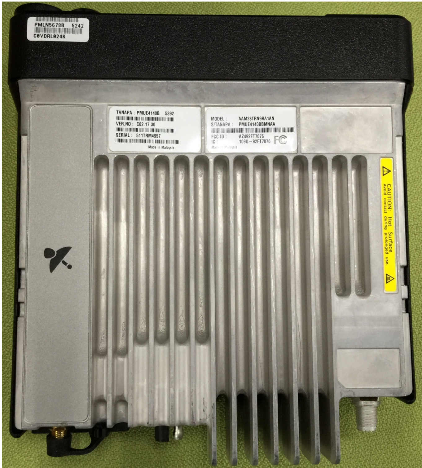
Bottom view (FCC Label Location)