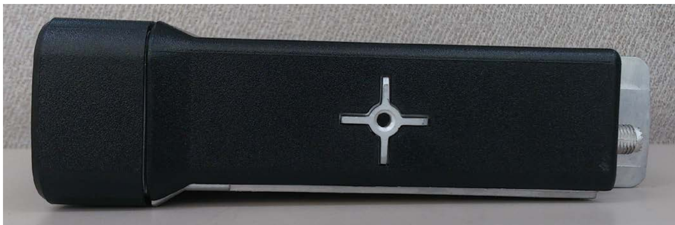
Side View (Right)