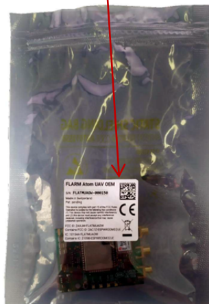
Atom UAV OEM in ESD bag with label