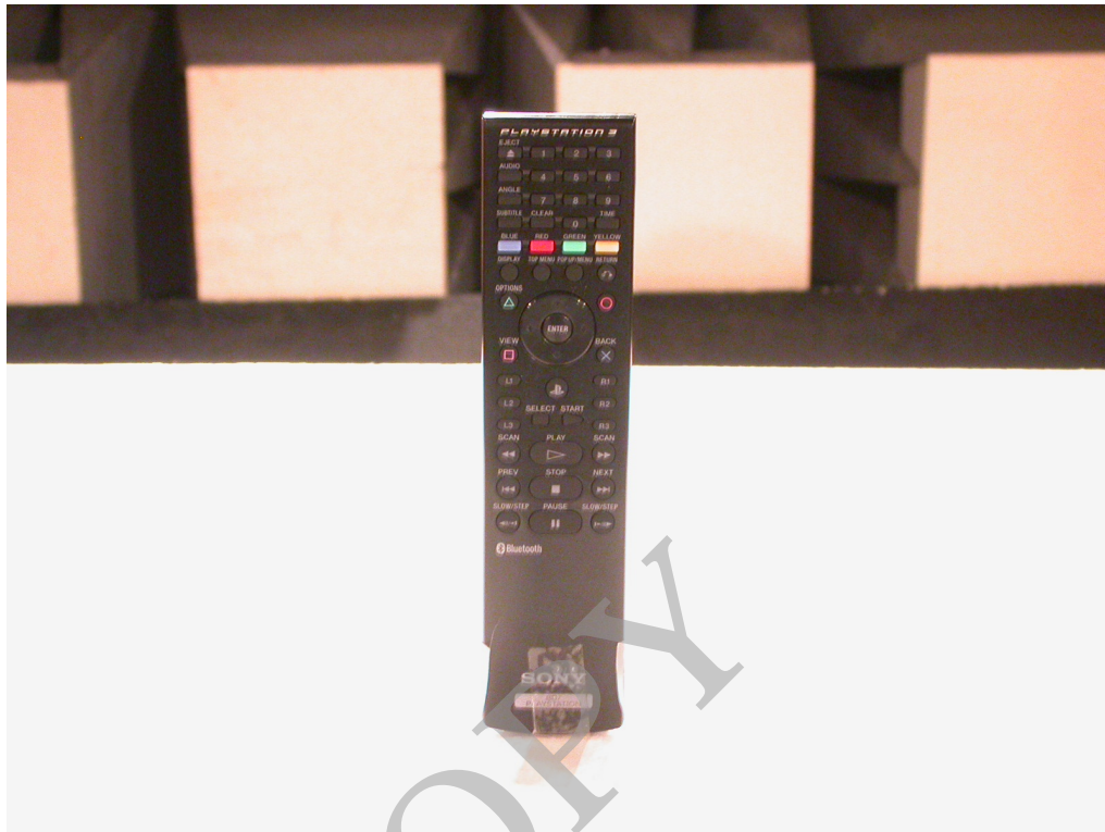
- X axis -

Photograph present configuration with maximum emission