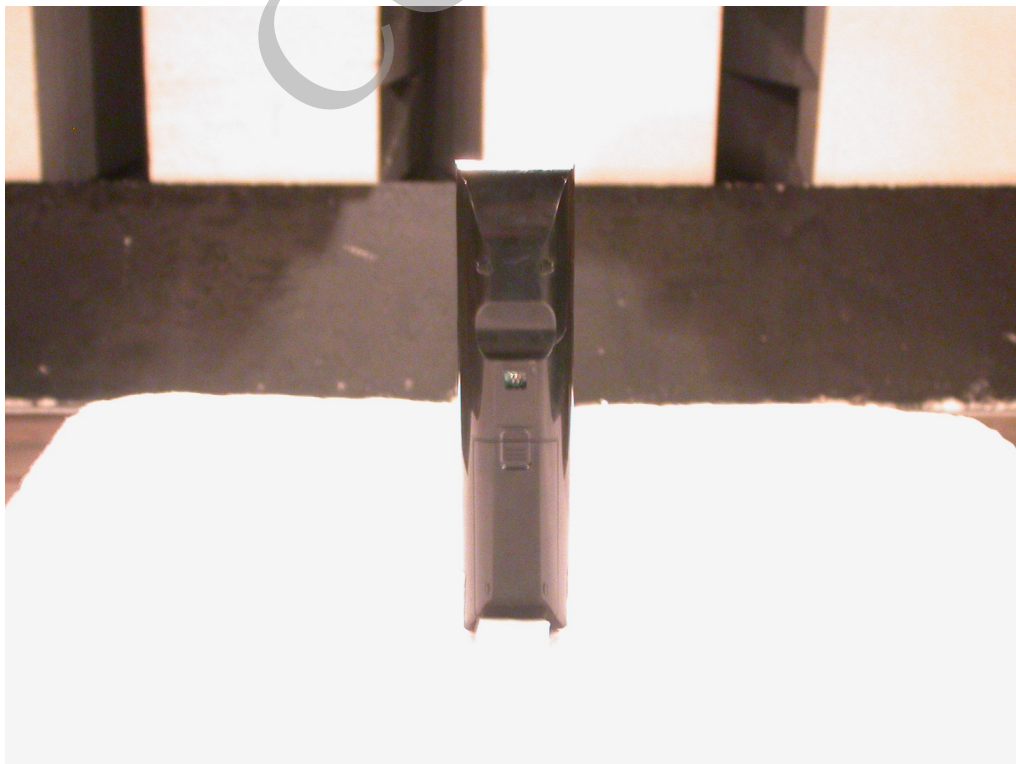
- X axis -