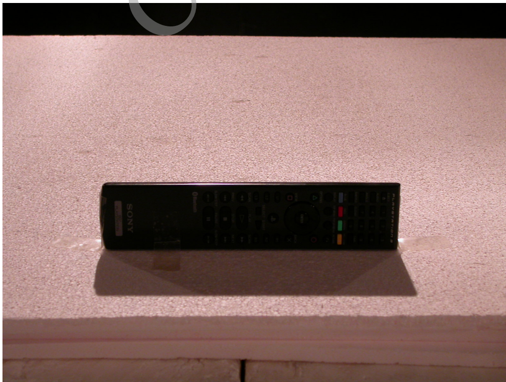
- Y axis -