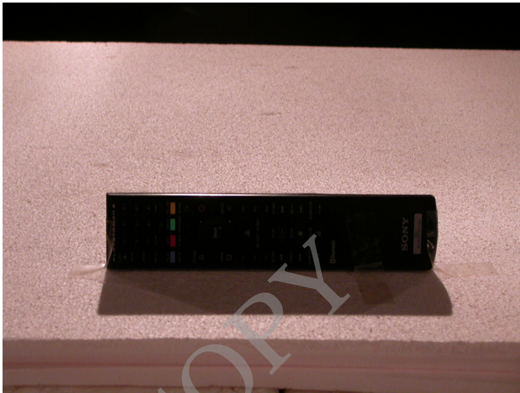
- Y axis -

Photograph present configuration with maximum emission