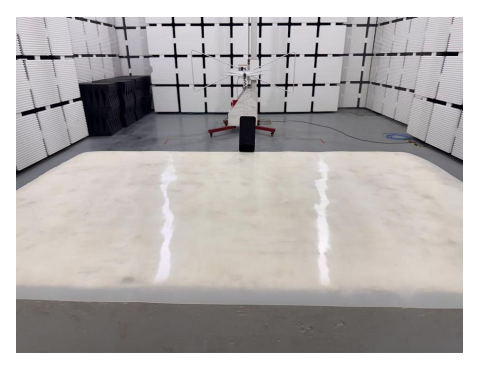
Set-up for Transmitter & Receiver Spurious Emissions, 30MHz to 1000MHz

Set-up for Transmitter & Receiver Spurious Emissions, 9kHz to 30MHz