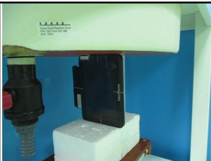
Body - Right Side of EUT at 0 mm