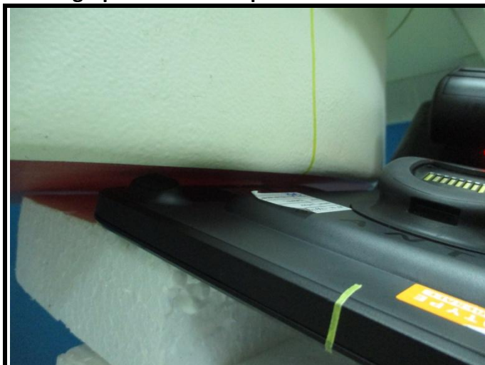
Body - Rear Face of EUT at 0 mm