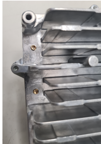
Photograph No.1 Front view