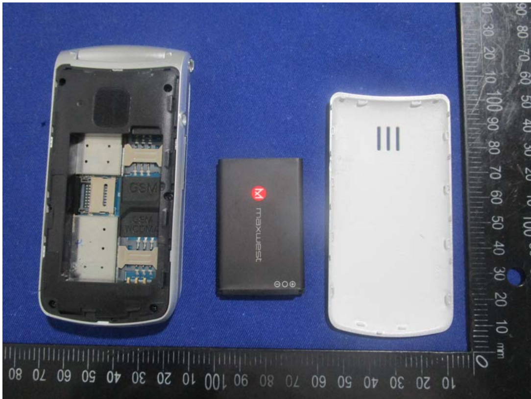
EXHIBIT C - EUT INTERNAL PHOTOGRAPHS