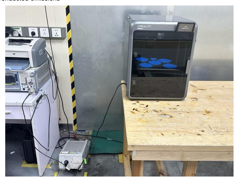
Radiated Measurement Photos