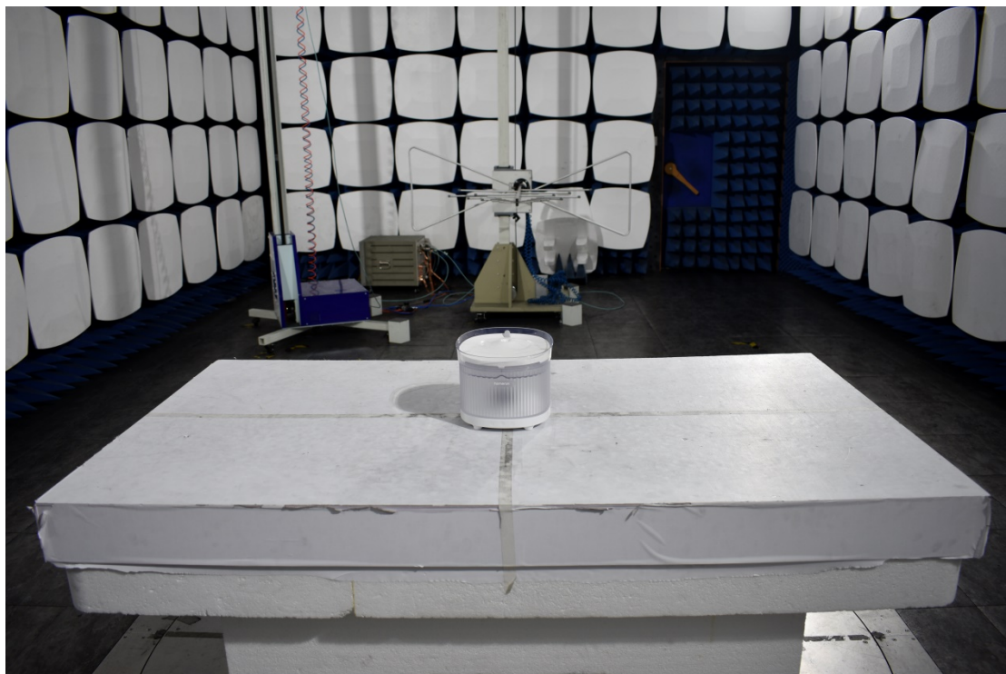
4. Radiated emission (1GHz-18GHz)