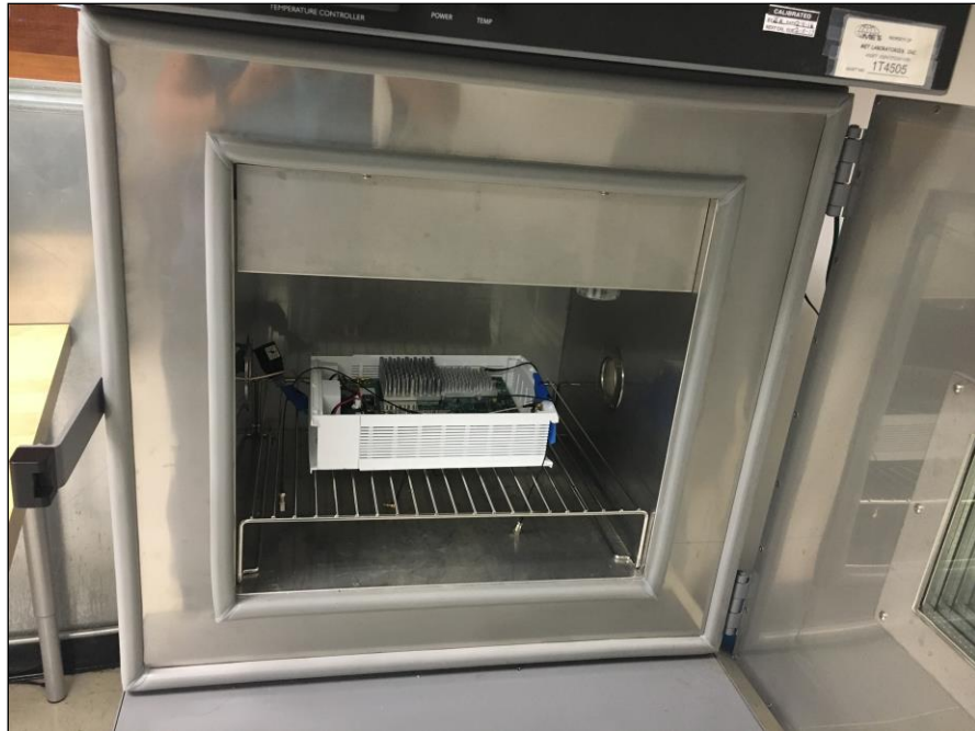
Photograph 3. Frequency Stability, Test Results