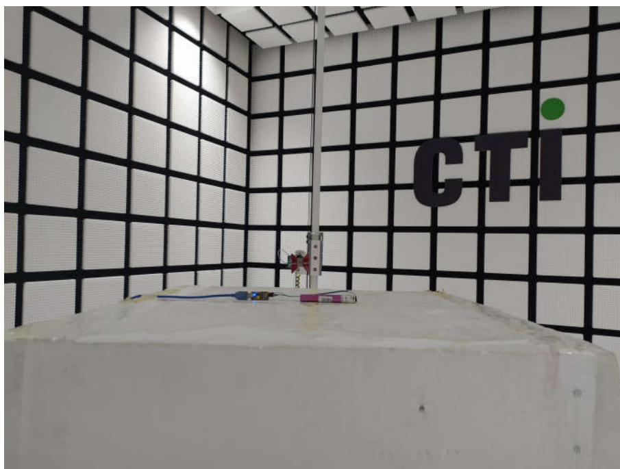
Radiated spurious emission Test Setup-2(Above 1GHz)